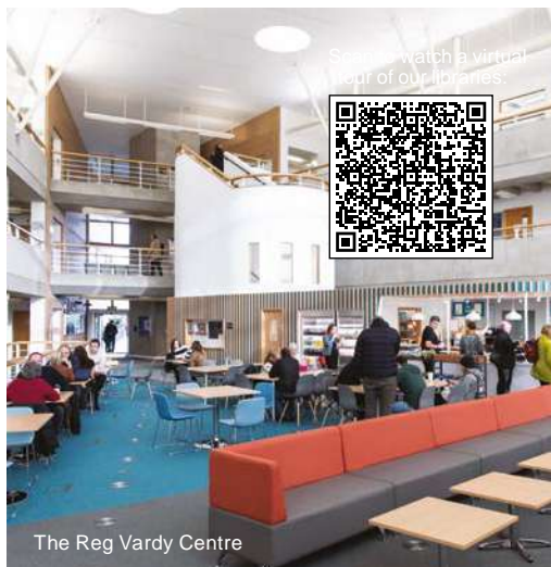
The Reg Vardy Centre

You'll also find The David Puttnam Media Centre, where students studying Journalism, English, Social Media Management, Media Production, Film, TV, Screen Performance, Animation and Radio can take advantage of industry-standard equipment in 4,600m 2 of studios, workshops and editing suites.